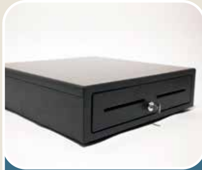
Minota Cash Drawer