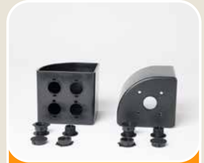
Architect Tech Mounts