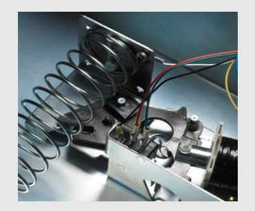
Heavy Duty Latch Mechanism

Ensures effortless performance and durability.