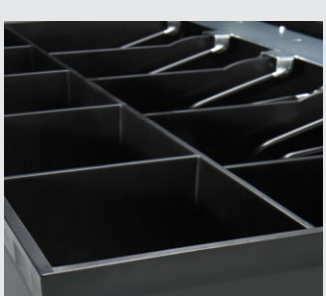
Heavy Duty Till

The MultiPRO® Interface adapts to most POS platforms.