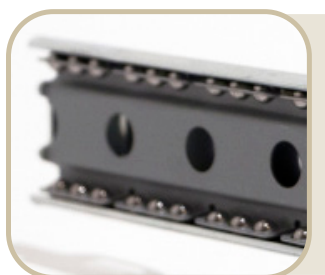
Durability Industrial-Grade Steel Ball Bearing Slides ensures effortless

A robust latch mechanism and a proven four-function lock assembly offer several levels of security. Along with flexible storage space, and various sizing, color and customized options, these features make the Series 4000 another reason for apg's reputation as the preferred choice.