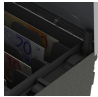
Stainless Lid Option