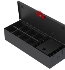
23821 6 Note Insert and Anti Grab