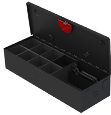
24241 3 Note Insert