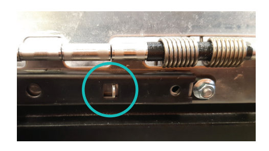
The quick release latch enables easy removal of the SMARTtill Unit from the baseplate