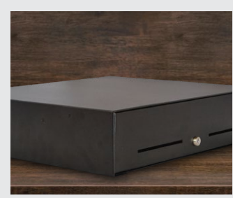
Stylish design built with solid steel construction, giving it a modern and clean look.

Robust, secure and an attractive price, retailers with high footfall shops will enjoy the performance of the Phoenix cash drawer.