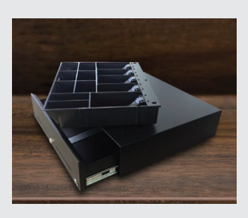
High Capacity Save back office labour by taking advantage of the high capacity insert, which reduces the need for multiple top ups during the day.