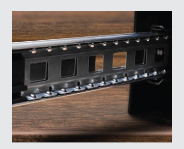
Highly Durable Featuring a robust steel construction with steel ball bearing runners for a prolonged operational life.