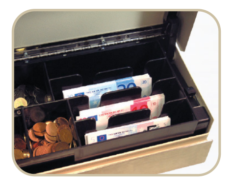
Stage 3 Notes leave the drawer.