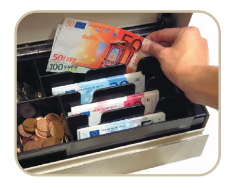
Stage 1 Place the notes in the rear compartment during the end of the transaction.