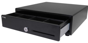
Vasario Series 1313

Our IP-enabled cash drawers are available with an external power adapter or PoE.