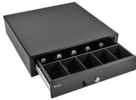
Vasario Series 1616

Our IP-enabled cash drawers are available with an external power adapter or PoE.