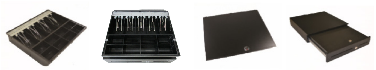
4 notes compartment